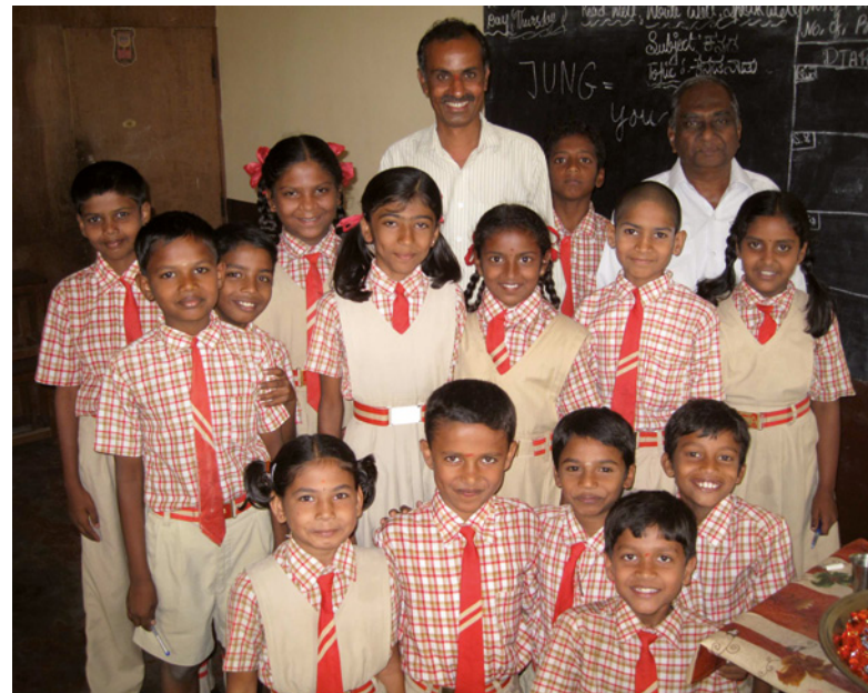
Pupils from our slum school in Bangalore

But also within the medical technology, biotechnology, space travel and genetic and pharmaceutical research India has reached the global stage. About 150,000 only new informatics engineers are leaving university in India. Especially graduates from elite-universities are preferred choice for demanding. But also the literacy rate has been increased very strongly the last year (from approx. 63% (2006) to 74% (2011). The number of internet users has been explosively twenty-fold from 0,5% (2000) to approx. 10% (2011). Despite of the rapid development the situation keeps as it is that for a big amount of the In-